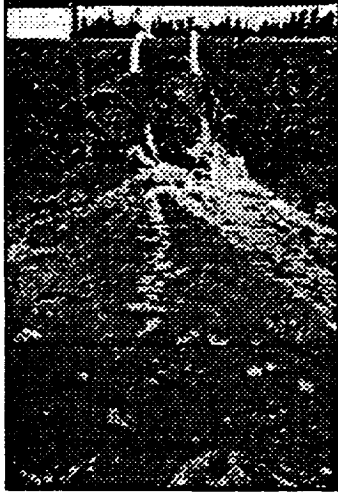
TREATED EFFLUENT being discharged last June at Yellowstone National Park, where the antiquated sewage system often fails.

Even the Environmental Protection Agency, charged with enforcing the country's environmental laws, has been fined for violating toxic waste laws at its laboratories. At the EPA's lab in Lexington, for example, mercury was discovered leaching into the ground water three years ago.